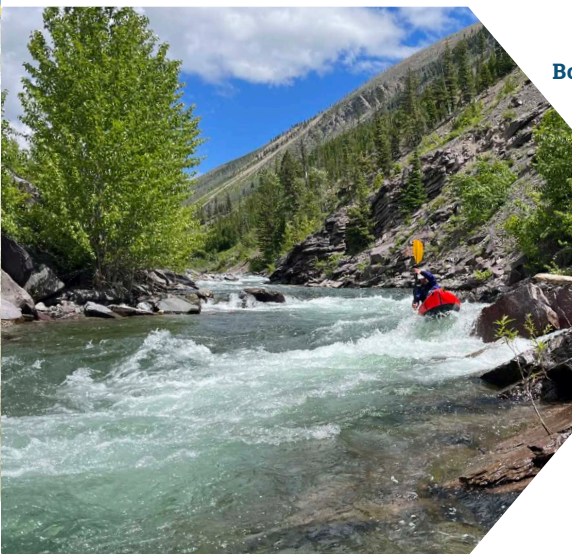
North Fork Blackfoot River (MT) | Photo Kevin Colburn (both)

Center: Much of our work in the Mid-Atlantic is focused on improving river access opportunities. One example is on the Meadow River (WV), where a popular access area was closed and we've been working with the climbing and economic development communities to explore options for improving access in ->