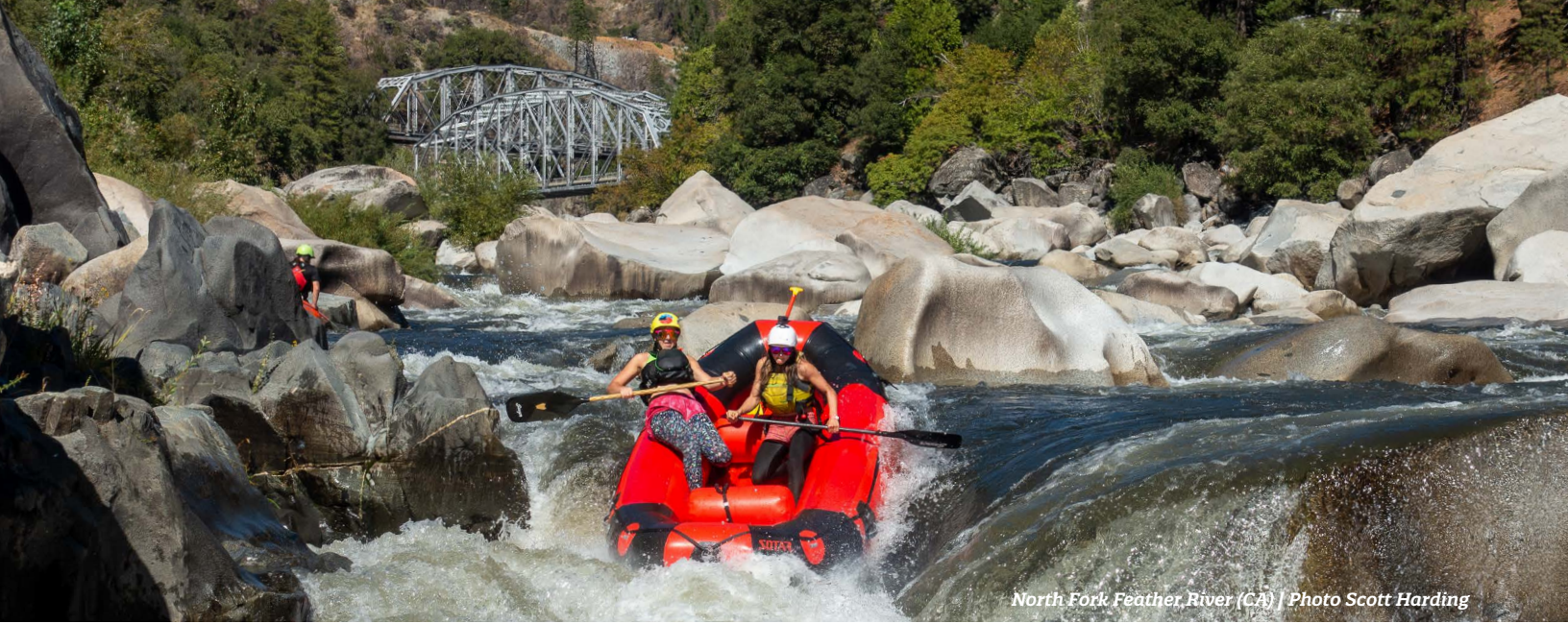
North Fork Feather River (CA)

Top: The California Public Utilities Commission, Pacific Gas & Electric is proposing to spin off all their non-nuclear assets including all hydropower projects to a separate subsidiary. This puts at risk 500 river miles that American Whitewater has spent nearly 30 years of work to protect. American Whitewater is advocating to State and Federal agencies to oppose this application unless there are strict conditions and accountability for the public interest, dam safety, and the protection of our rivers across California.