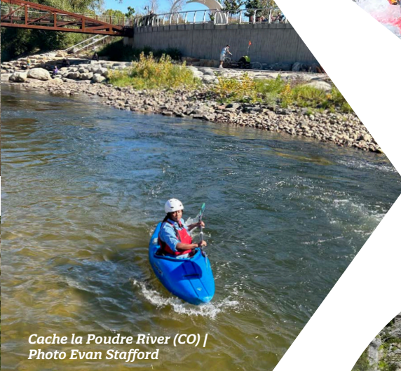
Cache la Poudre River (CO)

Top: Completing the effort to bring the Northwestern Park Access on the White Salmon River (WA) into public ownership is a top priority for early 2024. This is one of several projects ->