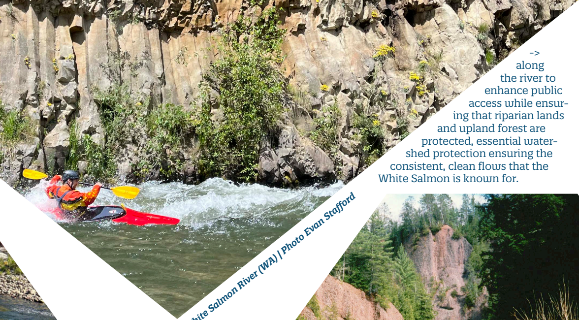
White Salmon River (WA)

-> along the river to enhance public access while ensuring that riparian lands and upland forest are protected, essential watershed protection ensuring the consistent, clean flows that the White Salmon is known for.