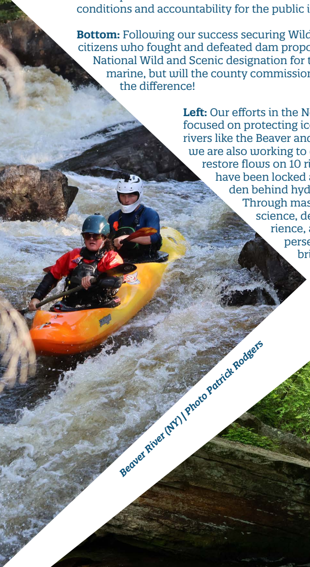
Beaver River (NY)

Right: We are leading on-the-ground river access improvements at the Upper Taylor River (CO) put-in and anticipate having complete design plans for stairs, raft slides, restoration, and erosion control measures by the Spring of 2024. The Taylor is a whitewater gem with a complex history of legal access issues; American Whitewater is also working at the state level to secure the public's right to access rivers.