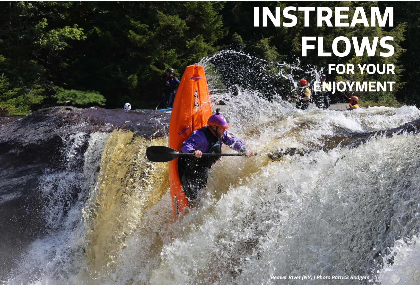
Beaver River (NY)