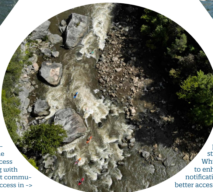
Meadow River (WV)

-> along the river to enhance public access while ensuring that riparian lands and upland forest are protected, essential watershed protection ensuring the consistent, clean flows that the White Salmon is known for.