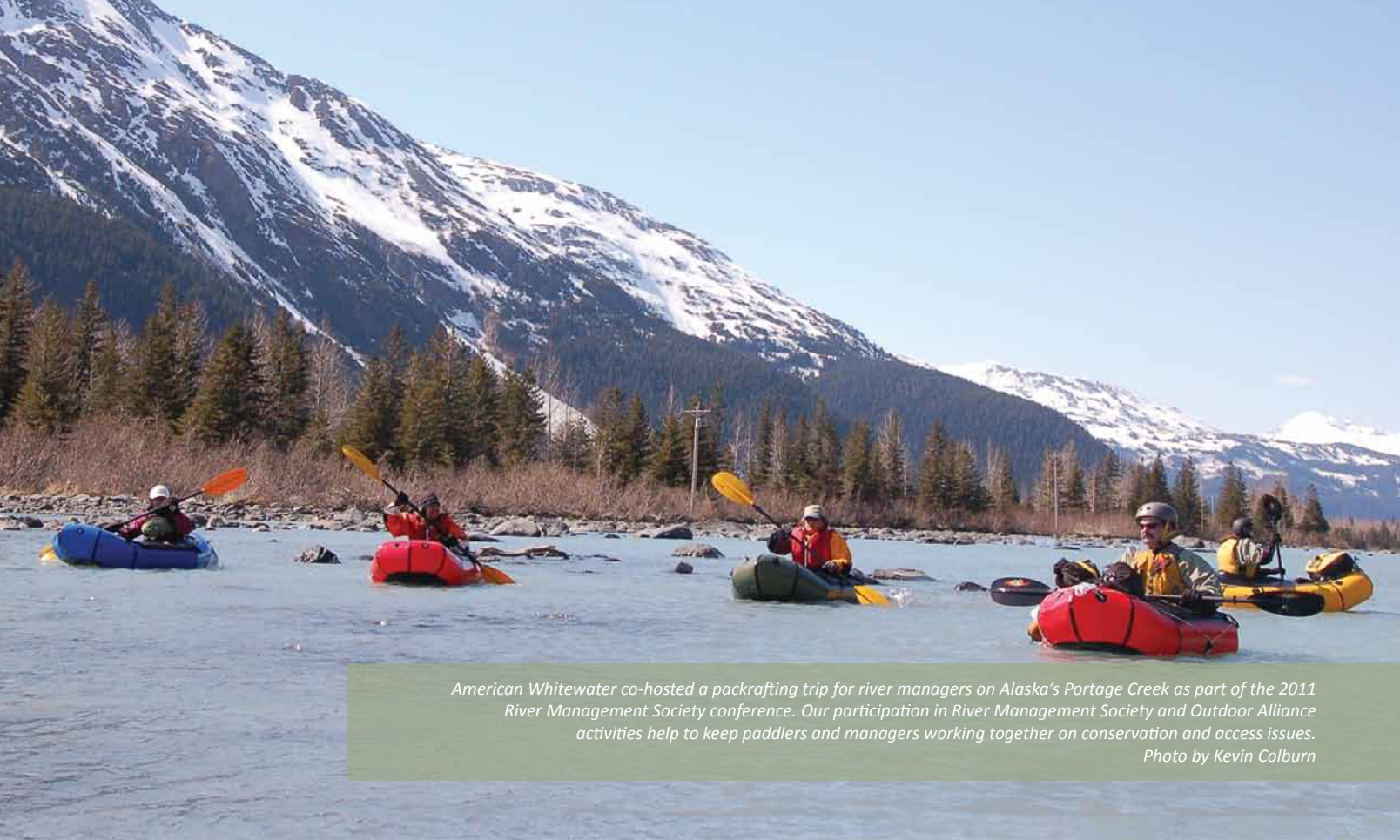
American Whitewater co-hosted a packrafting trip for river managers on Alaska's Portage Creek as part of the 2011 River Management Society conference. Our participation in River Management Society and Outdoor Alliance activities help to keep paddlers and managers working together on conservation and access issues.