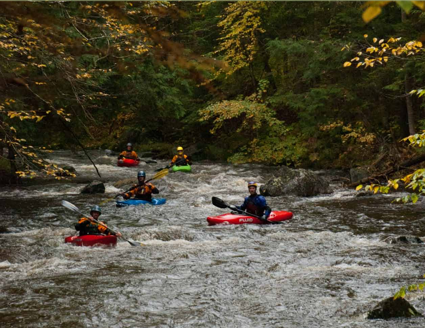
Green River, VT