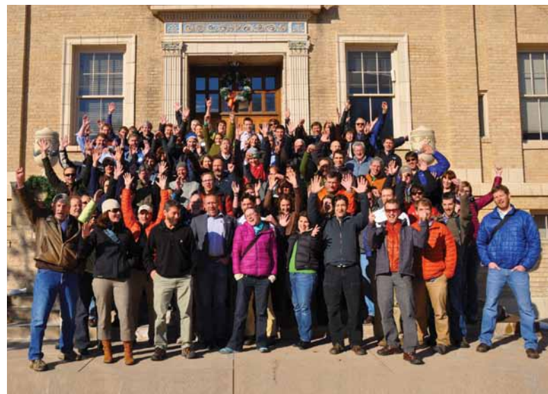
American Whitewater worked with our coalition members in the Outdoor Alliance to co-host the first ever summit focused on successful partnerships between the human-powered outdoor recreation community and the federal land management agencies. At least ten paddlers played presenting roles.

Here at American Whitewater we know the best thing we can do for the enjoyment of rivers is to protect the flows and special places that inspire paddlers. Sometimes though, we have to do more: we have to advocate for responsible recreational management that supports paddling. In 2011 we maintained a strong legal challenge of a Forest Service ban on paddling the upper Chattooga River, and responded to similar mismanagement of rivers in several National Parks. We also reorganized and recharged our efforts to resolve river access disputes in Virginia. But just as important as opposing bad river management, we also celebrated good river management. In December we co-hosted a national partnership summit with our colleagues in the Outdoor Alliance. This summit brought together leaders from the recreation community and federal land management agencies to share stories of successful partnerships that resulted in positive recreational, ecological, and economic outcomes. American Whitewater was an active participant in Outdoor Alliance policy initiatives as well as a contributing member of the River Management Society throughout 2011. Through these venues we proactively advocate for responsible river management that both protects rivers and keeps conservation-oriented Americans in touch with them.