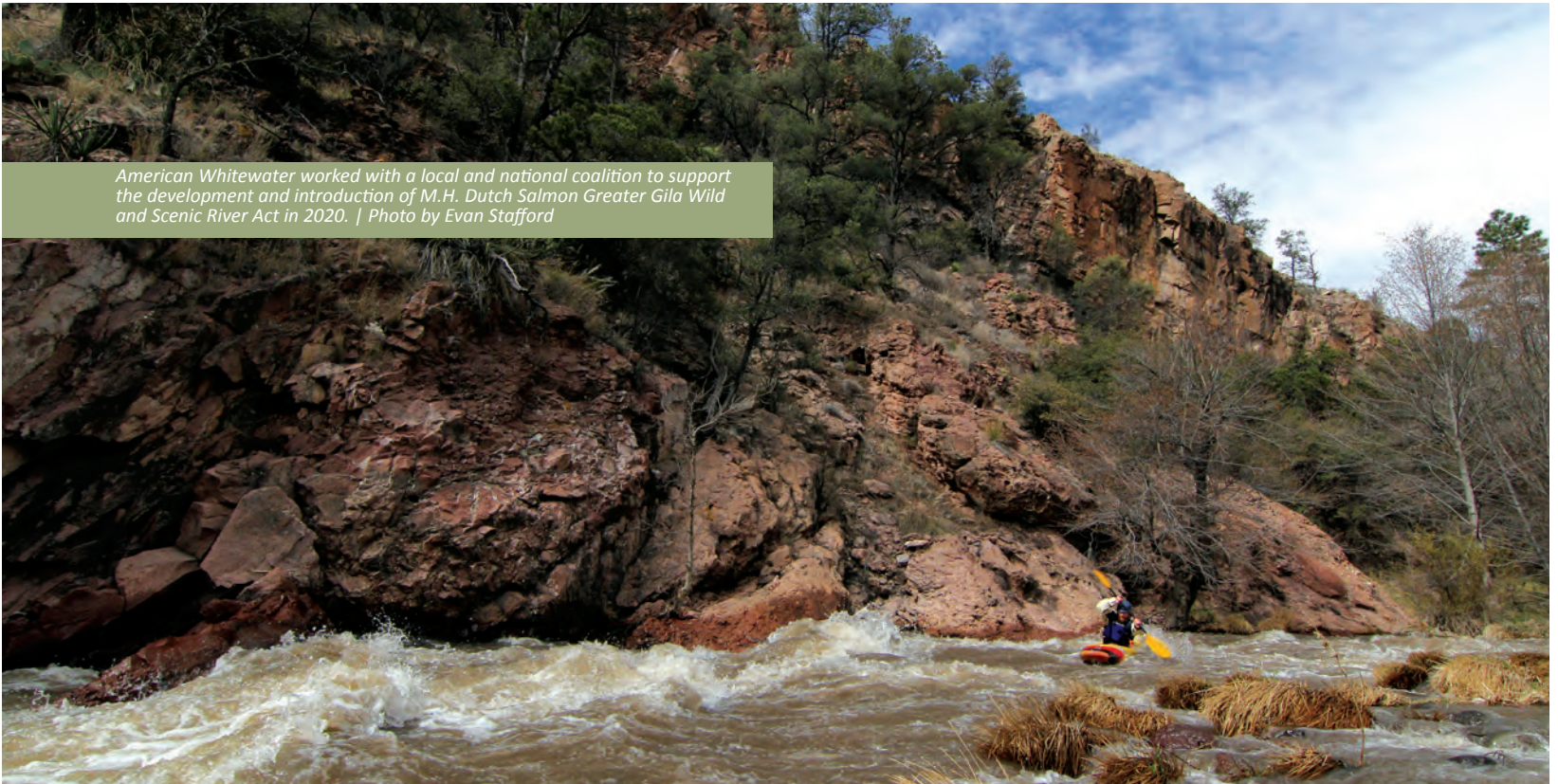
American Whitewater worked with a local and national coalition to support the development and introduction of M.H. Dutch Salmon Greater Gila Wild and Scenic River Act in 2020.

As in many areas of the country, we struggled with how best to respond to pandemic related closures at recreation sites. We worked with regional leaders to re-open recreational opportunities and were among the leaders to establish the Recreate Responsibly Coalition. The coalition spread nationally and we expect it will continue on in future service as a forum for more effective partnerships and improved communication among user groups and managers. With robust engagement from our volunteers, we successfully defeated an ill-conceived effort by the Washington State legislature to impose a state-mandated paddler education program. On the Nooksack River we were pleased to see the Nooksack Dam finally removed after three decades of engagement. Now that the dam has been removed, we will be working to permanently protect the river from future dams or water development projects. We continued efforts to support removal of the Klamath Dams while ensuring that a future vision for a restored river includes accommodations for recreation. We led an effort to better understand instream flow needs for recreation there and found spectacular opportunities in Ward's Canyon, a segment currently dewatered by the hydroelectric project.