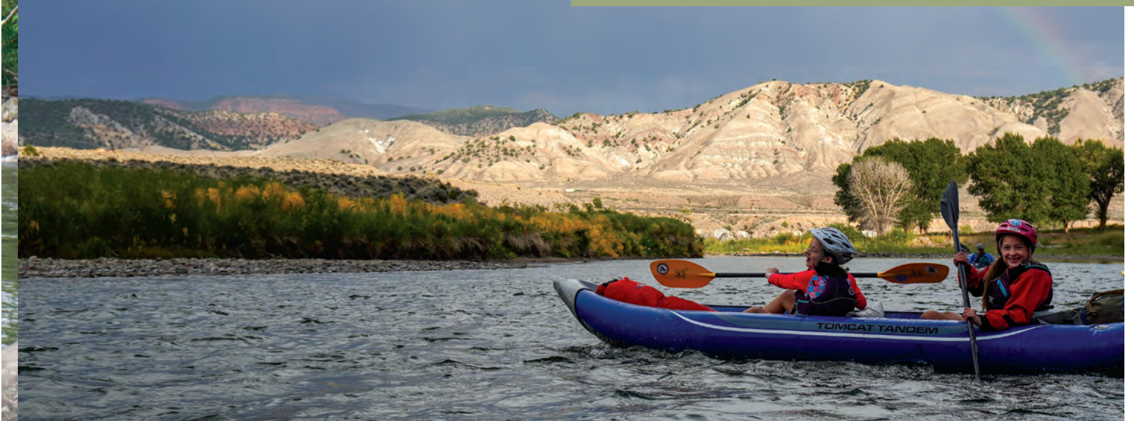
After over a decade of advocacy by American Whitewater, the Upper Colorado River Wild and Scenic Alternative Management Plan (AMP) was finalized and formally accepted in 2020.

The COVID pandemic presented challenges for northeast paddlers resulting in cancelled whitewater releases and access closures. American Whitewater worked to quickly restore access including reopening Bulls Bridge on the Housatonic in Connecticut where the closure eliminated important boating opportunities and had a disparate impact on diverse river users. Our work on hydropower dam relicensing continued, including a successful whitewater boating study on a new river reach on West Canada Creek in New York. On other rivers in the region, we worked to finalize the Settlement Agreement on the Mongaup River in New York and continued our advocacy efforts on a dozen other hydropower dams in the northeast.