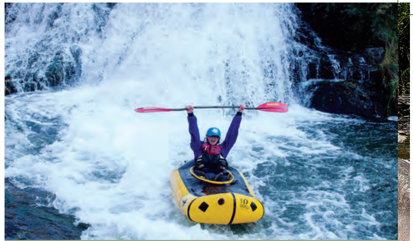
In 2020, American Whitewater pushed to responsibly maintain flows and access for numerous rivers in California, including the Pit River.

Last year the Great American Outdoors Act was signed into law, providing $9.5 billion to address the maintenance backlog on federally managed public lands and fulfilling a long sought goal for American Whitewater of permanent full funding for the Land and Water Conservation Fund (LWCF). Our community stood alongside us and pushed hard for the passage of this legislation and we're now focused on using the fund to invest in the enhancement of river access and recreational facilities. We were also leaders in the effort to secure passage of legislation with over a thousand miles of Wild and Scenic designations and millions of acres of protections for some of the most storied whitewater landscapes in the West, including the Grand Canyon (AZ), the Dolores (CO), the Olympic Peninsula (WA), and several whitewater rich watersheds in California (Trinity Alps, Central Coast, San Gabriels). The Protecting America's Wilderness Act (PAWA) was attached to the National Defense Authorization Act in December and passed in the House, but ultimately was not successful, when the Senate decided to pull the public lands provisions out of the final bill. This legislation however is now well positioned for action in 2021 and we continue to advocate on numerous fronts for it to become law.