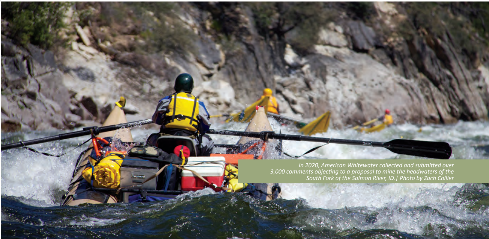
In 2020, American Whitewater collected and submitted over 3,000 comments objecting to a proposal to mine the headwaters of the South Fork of the Salmon River, ID.