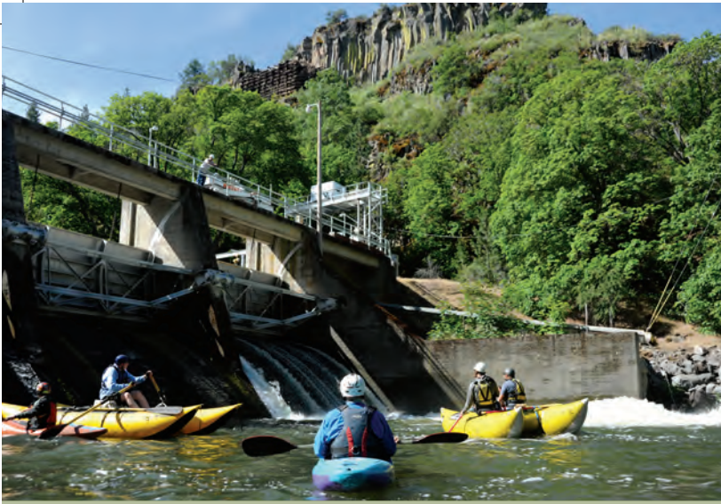
American Whitewater led an effort to define recreation flow needs on the Klamath River in California, as we continued to support the push for the removal of five dams along the river in 2020. | Photo by Thomas O'Keefe