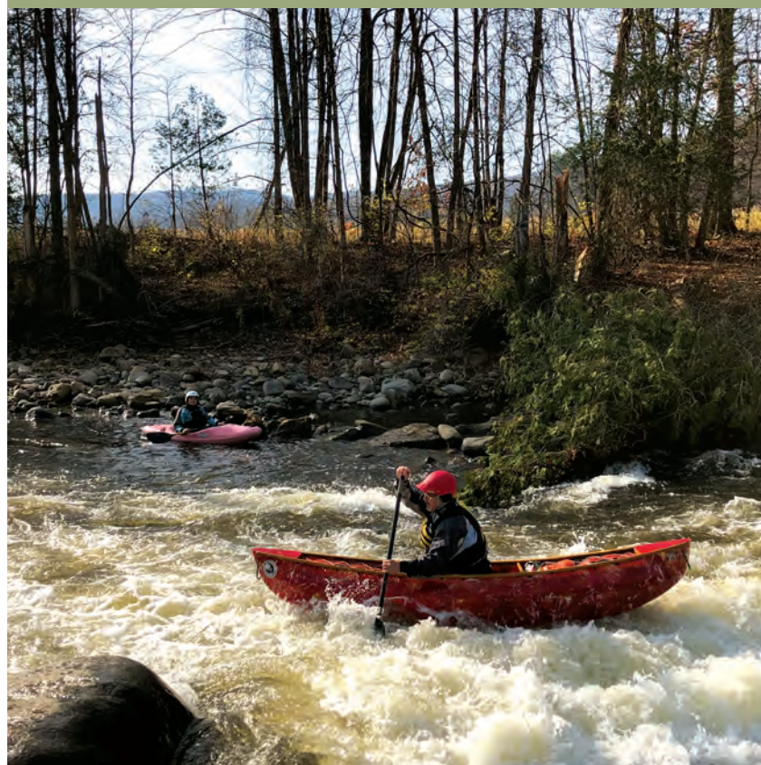
In 2020, American Whitewater conducted a successful whitewater boating study on West Canada Creek in New York State.

was shepherding an ever-growing movement to secure Congressional Wild and Scenic designation for the Nolichucky River. In North Carolina's high country American Whitewater also celebrated a new put in for the Watauga Gorge that we contributed to, and a new USGS stream gage on Wilson Creek that we secured funding for and commissioned.