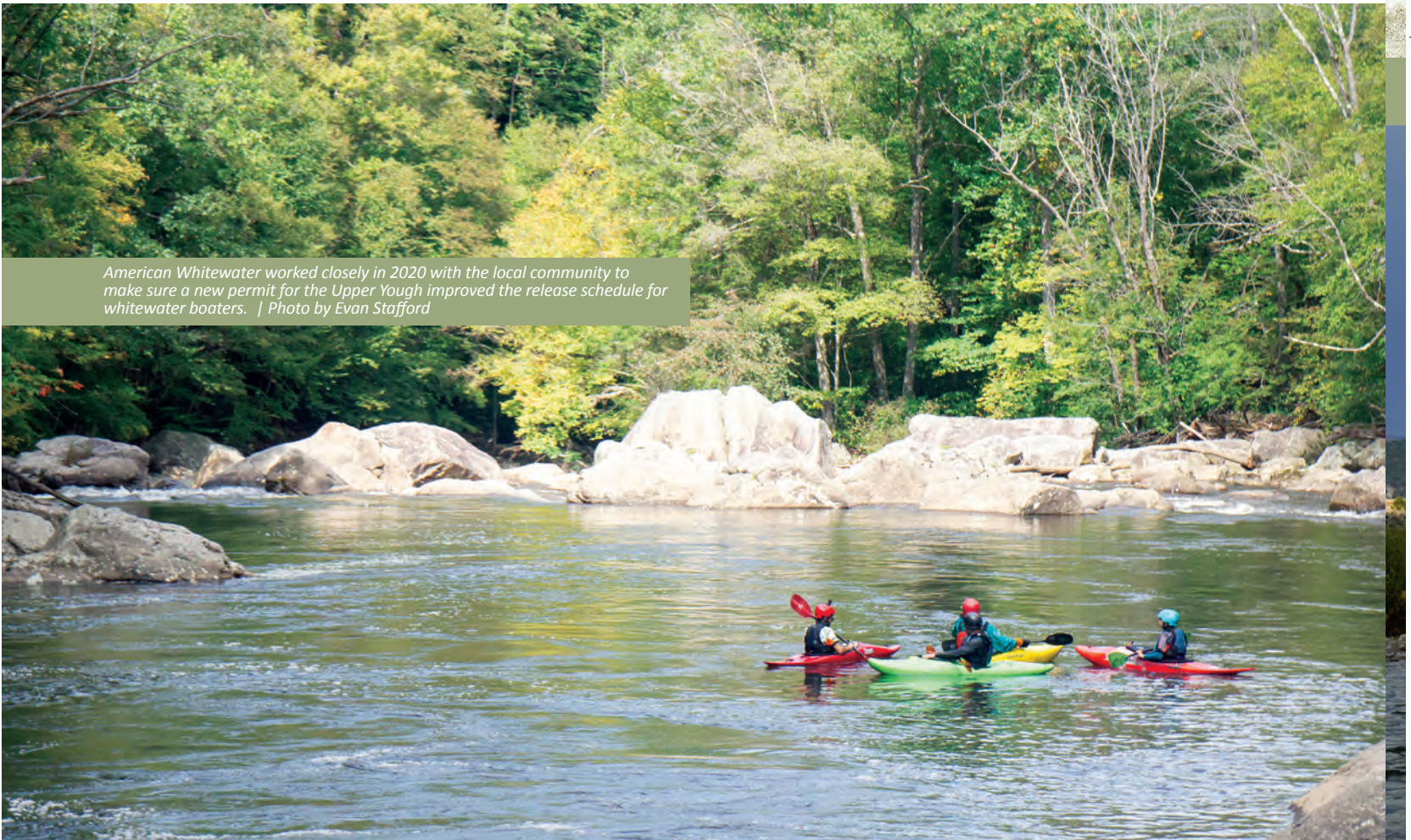
American Whitewater worked closely in 2020 with the local community to make sure a new permit for the Upper Yough improved the release schedule for whitewater boaters.

New permits for dams offer both risks and opportunities, and in 2020 American Whitewater helped local paddlers make improvements in the new permit for Upper Youghiogheny releases. In addition American Whitewater worked with local paddlers to improve paddler access in several state and county parks, provided access at several access sites that the organization owns or helps manage, and continued our role in scheduling releases on the Savage River, North Branch Potomac, and on the New River Dries where we recently negotiated flow restoration.