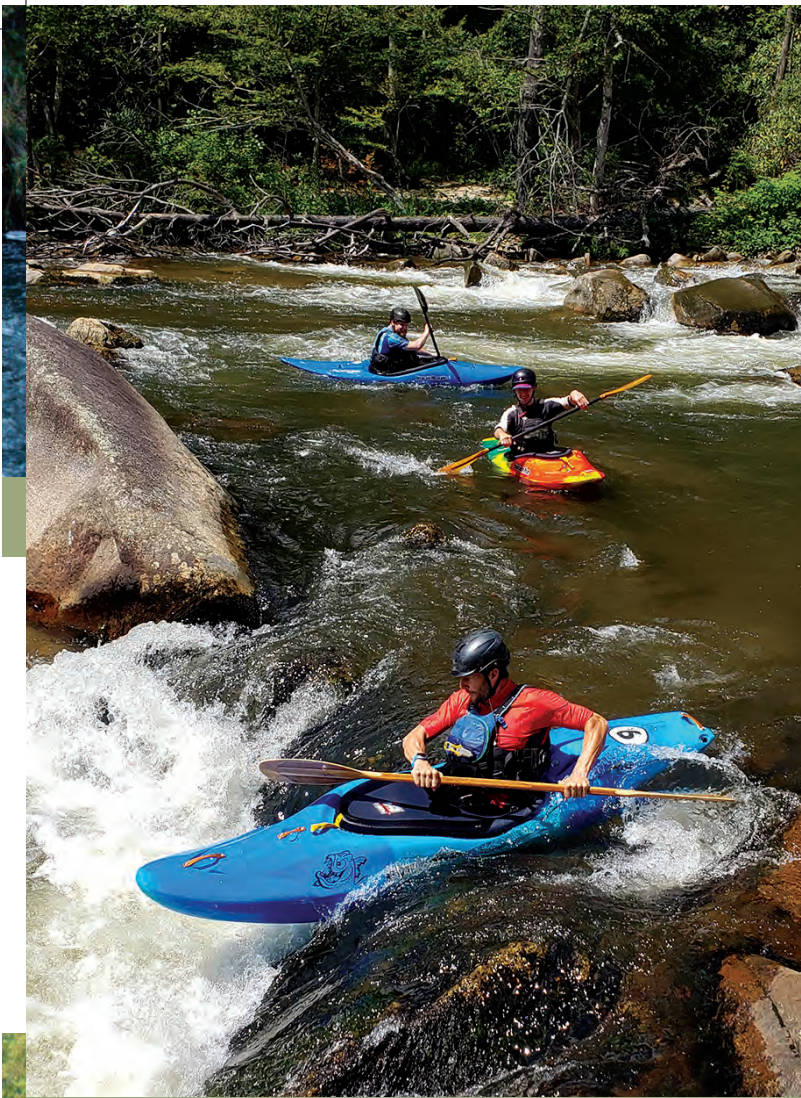
In 2020, after years of advocacy we secured a new USGS stream gage on Wilson Creek.